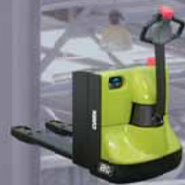
Low-lift Pallet Truck 2000 kg