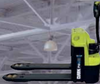
Low-lift Pallet Truck 2000 kg