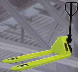
Hand Pallet Truck 2500 kg