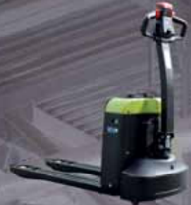
Low-lift Pallet Truck 1500 kg