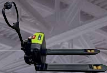
Low-lift Pallet Truck 1500 kg