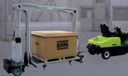
Tugging train with autonomous steering 1600 kg