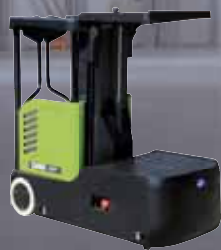
Multifunctional Order Picker 226 kg