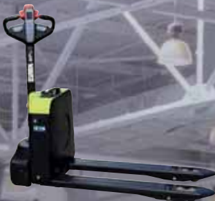
Low-lift Pallet Truck 1800 kg