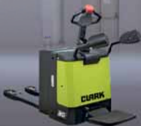
Low-lift Pallet Truck Platform version 2000 kg