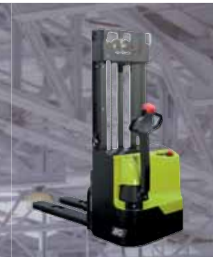
Pallet Stacker Multi-purpose Vehicle 2000 kg