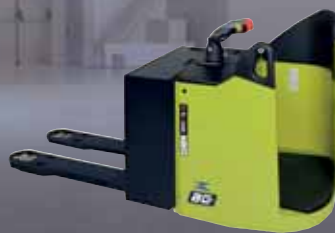
Low-lift Pallet Truck Platform version 2000 kg