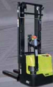
Pallet Stacker 1600 kg