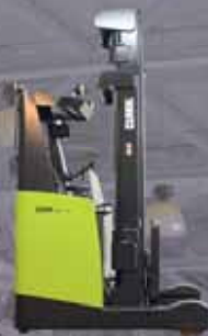
Reach truck 1400 / 1600 kg