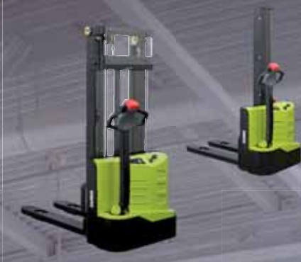
Pallet Stacker 1000 kg