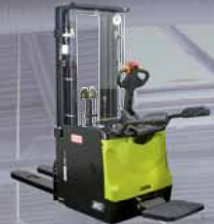
Pallet Stacker Platform version 1600 kg