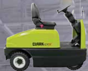
Electric Tow Tractor 4000 / 7000 kg